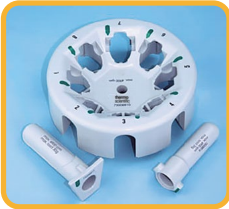
Unique DualSpin rotor with hybrid design