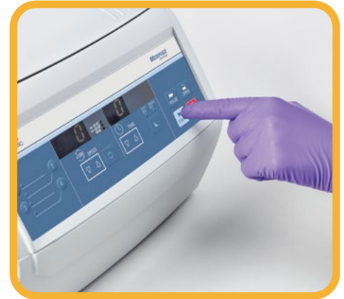
Large, brightly-lit display with intuitive controls