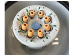
DualSpin rotor with swinging buckets