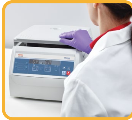
Fast one-click centrifuge lid closure